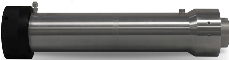
Stainless-Steel Hassler Type, Biaxial, or Triaxial Core Holder